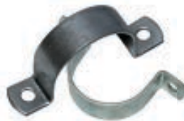
6A PIPE CLAMPS