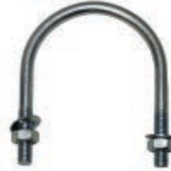
FIG 25 U-BOLT - LIGHT WEIGHT U-BOLTS