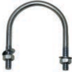
FIG24 U-BOLT HEAVY WEIGHT U-BOLTS